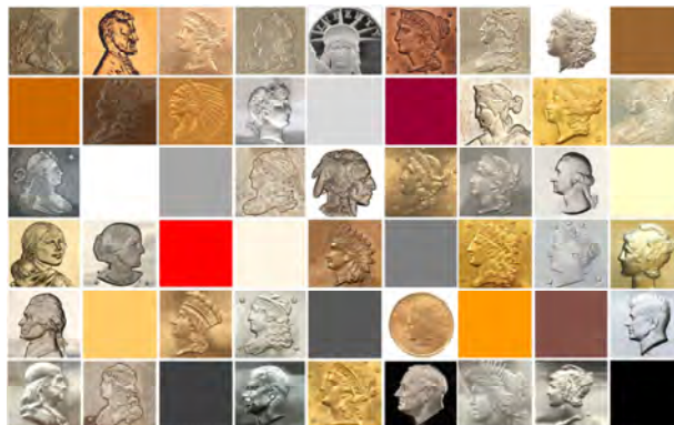
First place winning photo by WCC club president Jimmy Krozel.

The WCC canceled its March meeting due to COVID-19 and has held monthly meetings online since April. The meetings feature educational presentations and coins given away by random drawing. The club's October meeting included three numismatic quizzes.