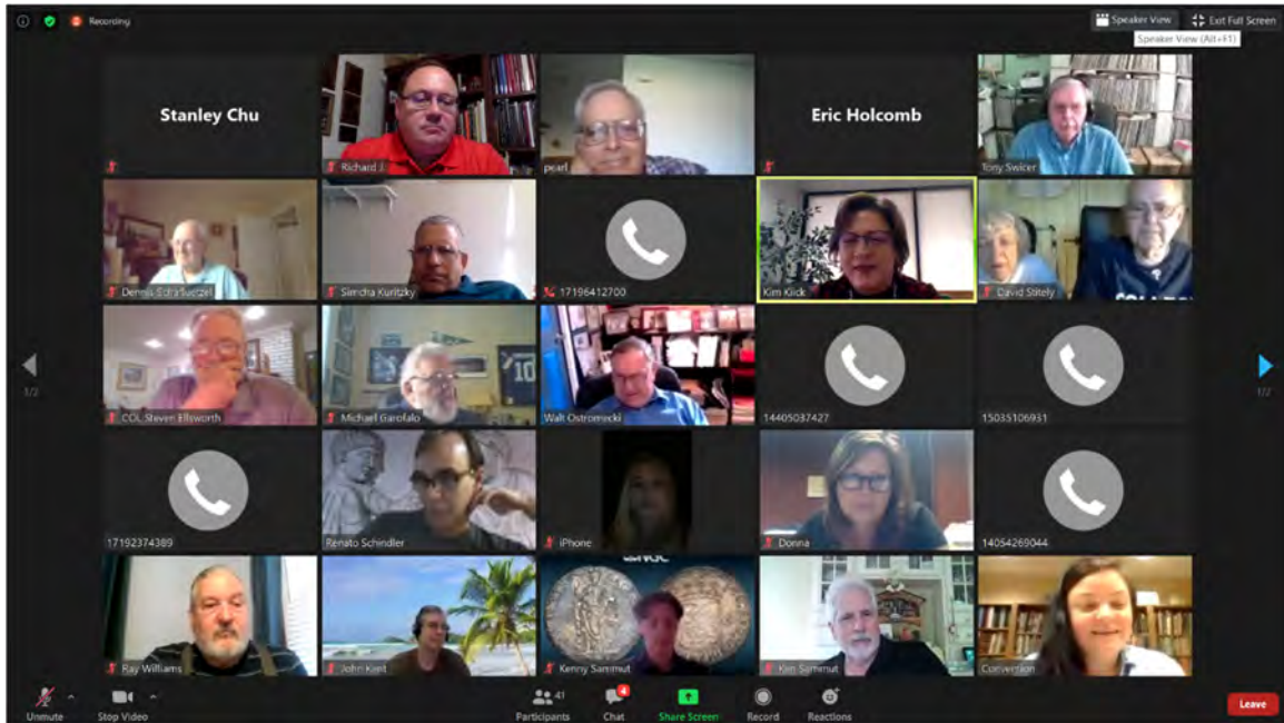
Screen Shot #1 from Annual District & Club Rep Meeting held on Aug. 6, 2020.