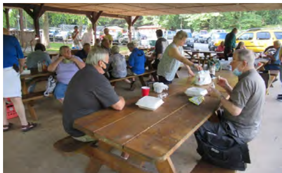
Mountain Coin Club members enjoying the picnic dinner provided by the club on Tuesday, July 14 in Blairsville, Ga.

The Mountain Coin Club met for the first time in-person since March on Tuesday, July 14, at Meeks Park in Blairsville, Ga. The club held a picnic dinner and auction outdoors since the club’s normal meeting site was closed due to COVID-19. Many club members attended the meeting, and the club provided boxed sandwiches. The club’s August and September 2020 meetings were also held outdoors at the same park.