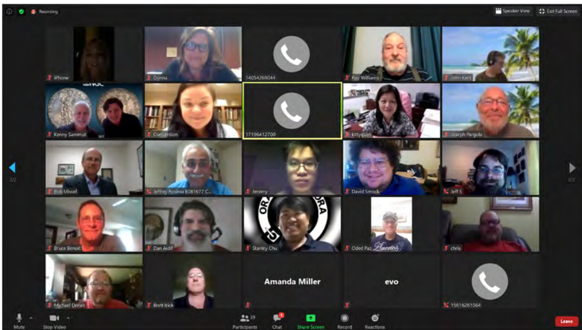
Screen Shot #2 from Annual District & Club Rep Meeting held on Aug. 6, 2020.